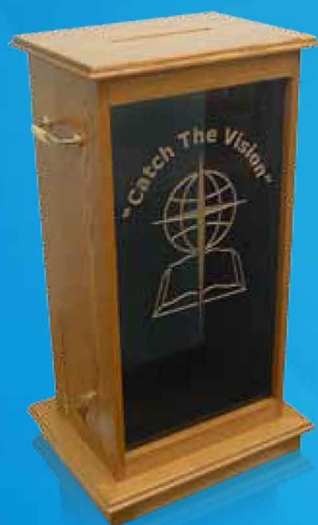
Standing Offering Box