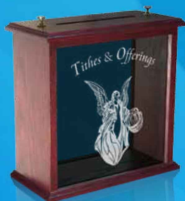
Table Top Offering Box