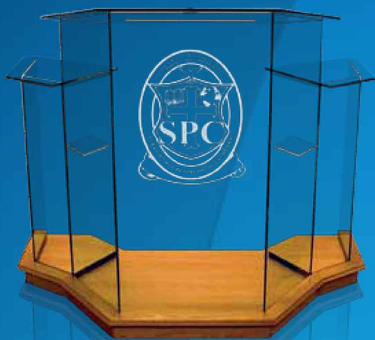
NCI - Clear Glass

The Winged Pulpit augments our Foundation model with elegant fixed wings sweeping back from the sides. The result is a pulpit that invites the entire congregation and embraces the speaker behind it.