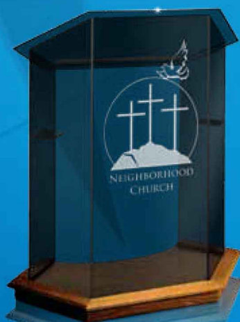
NC10G - Tinted Glass

This traditional pulpit design, crafted in contemporary glass, allows your congregation an unhindered view of the worship service.