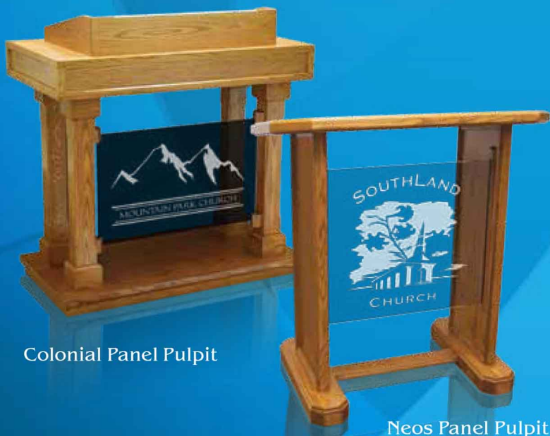
Colonial Panel Pulpit

These traditional pulpit designs, crafted in contemporary glass and oak, allow your congregation an unhindered view of the worship service.